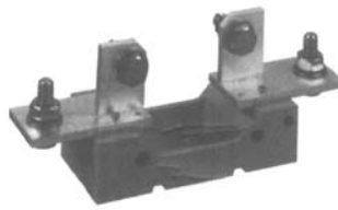
SI DIN 80 and 110